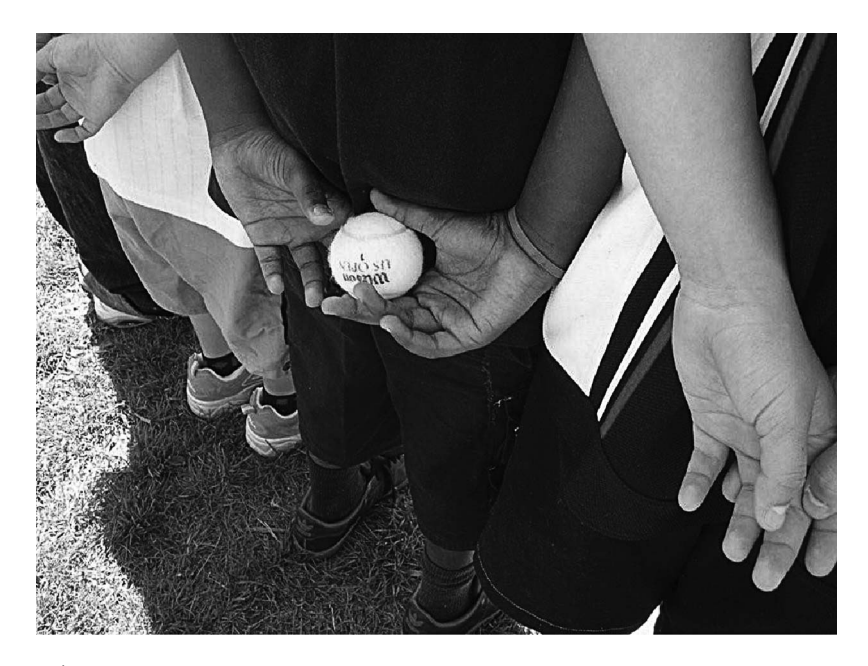
FIGURE 4 Participants play a game "Don't Trust Your Eyes," which includes a lesson that you cannot know if someone has HIV from their appearance (ages 13–16, disclosed youth).

In an analysis of facilitator reports, it was found that the use of activities such as artwork and music were effective in enabling the exploration of feelings for undisclosed and disclosed children. This was particularly so for those who were uncomfortable discussing issues directly. As one participant noted in a postsurvey: "I got to talk about HIV/AIDS from a different perspective." Children also reported a preference for activities that provided fun and allowed them to develop a special skill and a sense of accomplishment and pride about learning something new (e.g., artwork, martial arts).