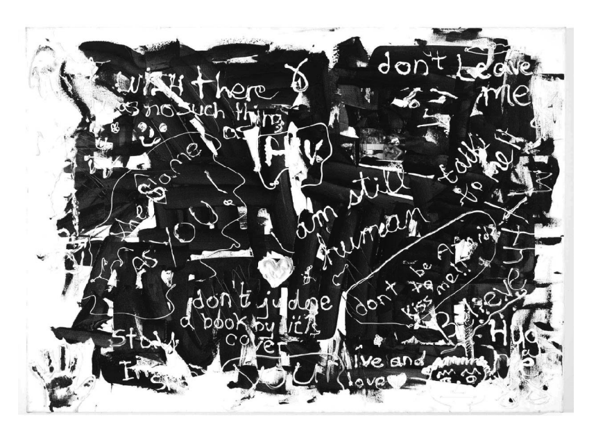
FIGURE 3 Talk to me photo (ages 13-16, disclosed youth).

"Alone", "Talk to me," "Don't judge a book by its cover," "I'm the same as you," "Don't leave me," and "Don't be afraid to kiss me."